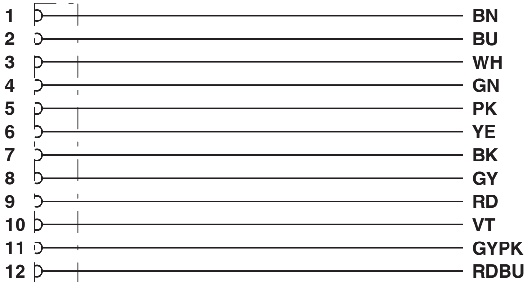
Contact assignment of the M12 socket