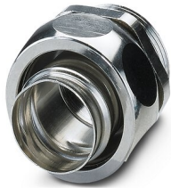
Cable gland made from brass with Pg thread, IP40 protection

https://www.phoenixcontact.com/pc/products/3241041