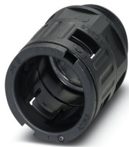
Cable gland, Pg thread, IP66 protection, straight

https://www.phoenixcontact.com/pc/products/3240892