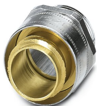
Cable gland made from brass with Pg thread, rotatable, IP40 protection

https://www.phoenixcontact.com/pc/products/3241027