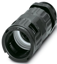
Cable gland, Pg thread, IP66 protection, with strain relief

https://www.phoenixcontact.com/pc/products/3240948