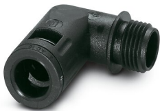
Cable gland, Pg thread, IP66 protection, angled

https://www.phoenixcontact.com/pc/products/3240916