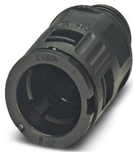
Cable gland, metric thread, IP66 protection, straight

https://www.phoenixcontact.com/pc/products/3240895