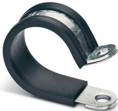
Hose clamp, material: Steel, galvanized, color: black/silver

https://www.phoenixcontact.com/pc/products/3240965