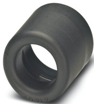
End sleeves as cable protection