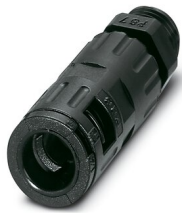
Cable gland, Pg thread, IP68/69k protection, with strain relief

https://www.phoenixcontact.com/pc/products/3240930