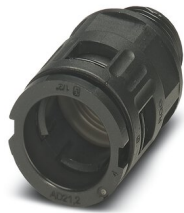
Cable gland, metric thread, IP68/69k protection, straight

https://www.phoenixcontact.com/pc/products/3240881