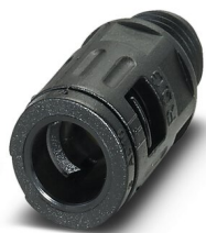
Cable gland, Pg thread, IP68/69k protection, straight

https://www.phoenixcontact.com/pc/products/3240874