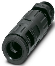
Cable gland, metric thread, IP68/69k protection, with strain relief

https://www.phoenixcontact.com/pc/products/3240938