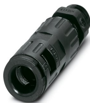
Cable gland, metric thread, IP66 protection, with strain relief

https://www.phoenixcontact.com/pc/products/3240952