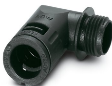
Cable gland, Pg thread, IP66 protection, angled

https://www.phoenixcontact.com/pc/products/3240917