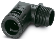
Cable gland, metric thread, IP66 protection, angled

https://www.phoenixcontact.com/pc/products/3240925