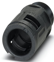
Cable gland, Pg thread, IP66 protection, straight

https://www.phoenixcontact.com/pc/products/3240890