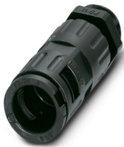
Cable gland, Pg thread, IP66 protection, with strain relief

https://www.phoenixcontact.com/pc/products/3240946