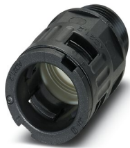
Cable gland, Pg thread, IP68/69k protection, straight

https://www.phoenixcontact.com/pc/products/3240877