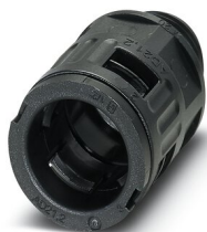
Cable gland, metric thread, IP66 protection, straight

https://www.phoenixcontact.com/pc/products/3240898