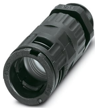
Cable gland, Pg thread, IP68/69k protection, with strain relief

https://www.phoenixcontact.com/pc/products/3240933