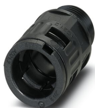
Cable gland, Pg thread, IP66 protection, straight

https://www.phoenixcontact.com/pc/products/3240891