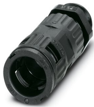
Cable gland, Pg thread, IP66 protection, with strain relief

https://www.phoenixcontact.com/pc/products/3240947