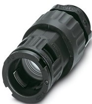
Cable gland, metric thread, IP68/69k protection, with strain relief

https://www.phoenixcontact.com/pc/products/3240941