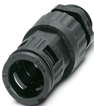
Cable gland, metric thread, IP66 protection, with strain relief

https://www.phoenixcontact.com/pc/products/3240955