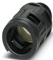
Cable gland, metric thread, IP68/69k protection, straight

https://www.phoenixcontact.com/pc/products/3240884