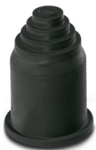
End sleeves, transition sleeves, from hose to cable

https://www.phoenixcontact.com/pc/products/3240977