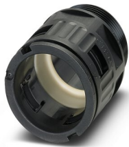
Cable gland, Pg thread, IP68/69k protection, straight

https://www.phoenixcontact.com/pc/products/3240879