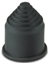
End sleeves, transition sleeves, from hose to cable

https://www.phoenixcontact.com/pc/products/3240979