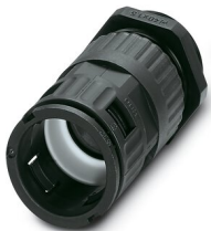
Cable gland, metric thread, IP68/69k protection, with strain relief

https://www.phoenixcontact.com/pc/products/3240943