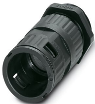
Cable gland, metric thread, IP66 protection, with strain relief

https://www.phoenixcontact.com/pc/products/3240957