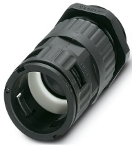
Cable gland, Pg thread, IP66 protection, with strain relief

https://www.phoenixcontact.com/pc/products/3240949