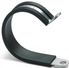
Hose clamp, material: Steel, galvanized, color: black/silver

https://www.phoenixcontact.com/pc/products/3240973